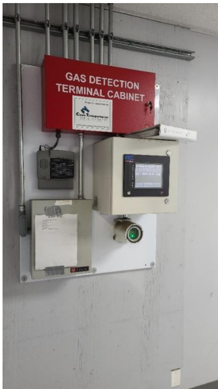
Methane Detection System